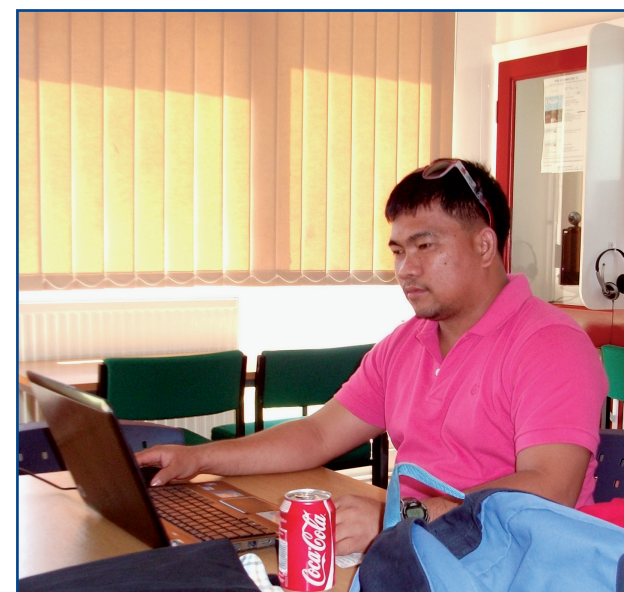
A seafarer making use of the Wi-Fi in the Hull Seafarers' Centre.