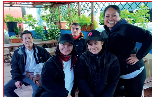
Seafarers relax in the welcoming atmosphere of the Gibraltar Seafarers' Centre