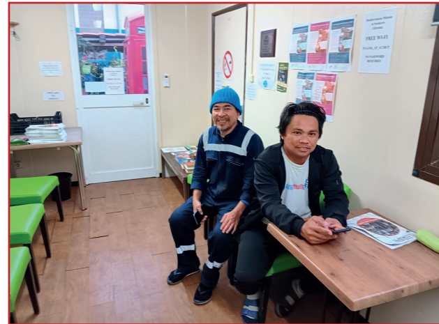
Seafarers can access free Wi-Fi 24 hours a day in the Wi-Fi cabin next door to the centre