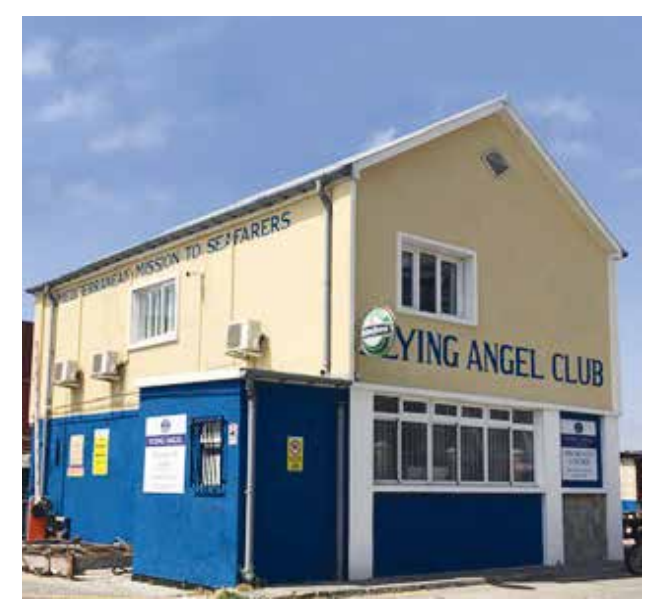
The interior and exterior of the Flying Angel Club were repaired after damage from water ingress and years of exposure to the elements