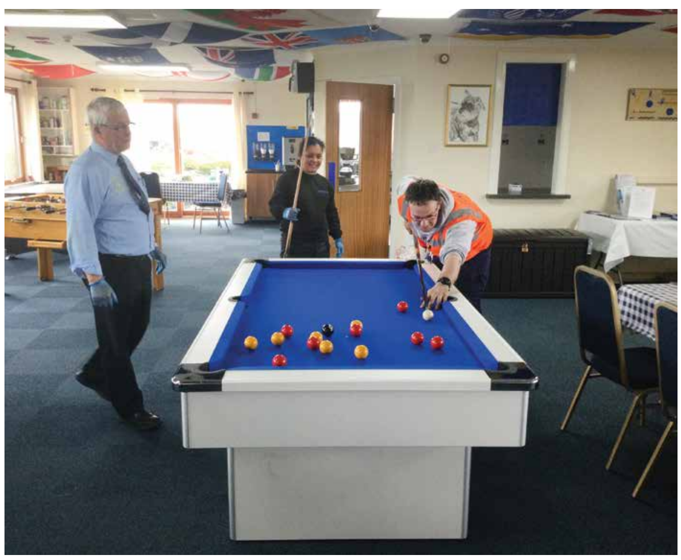
The new pool table at the Lighthouse Seafarers Mission