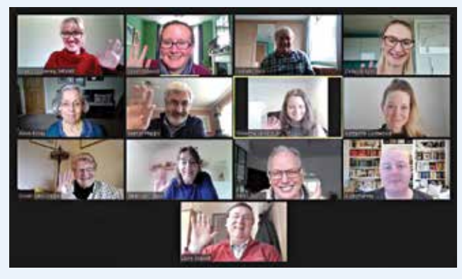
The Board's specialist Volunteer Ambassadors are introduced to MNWB staff via Zoom