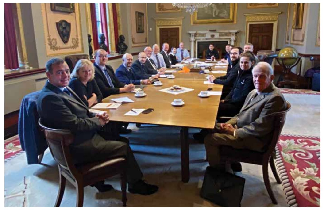
Members of the Humber PWC