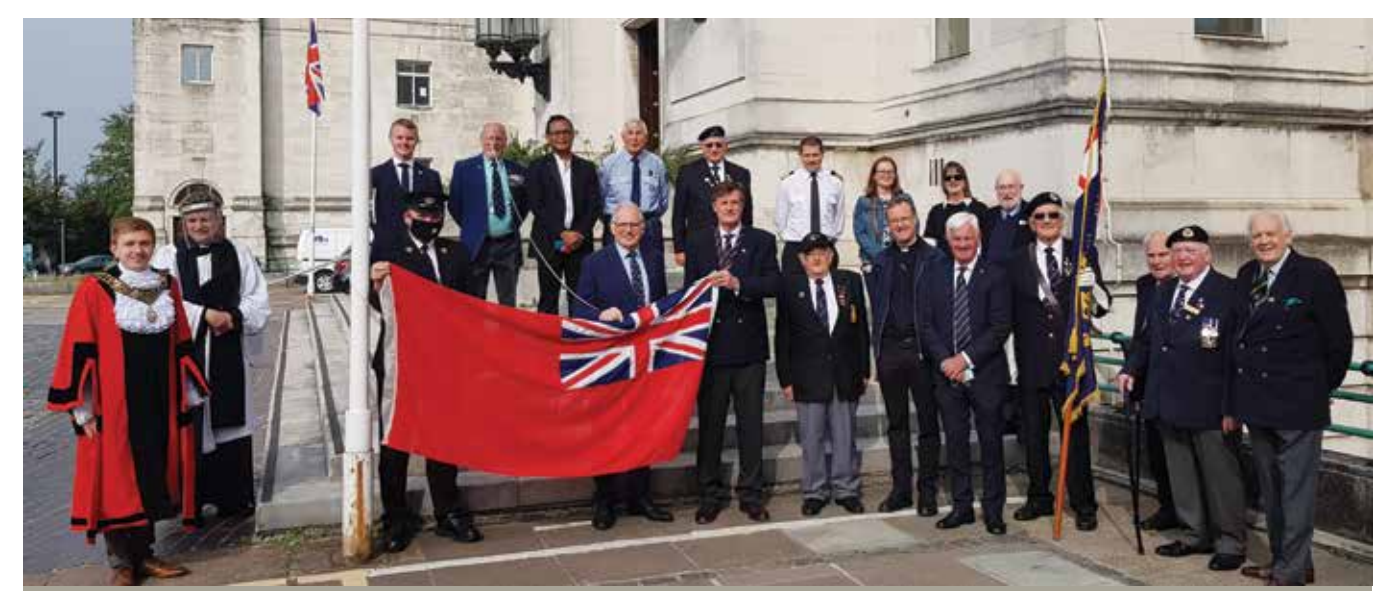
On Merchant Navy Day, 3rd September 2021, MNWB joined the Mayor of Southampton, Councillors and members of the local maritime community to honour and remember the sacrifice made by Merchant Navy seafarers during times of conflict.