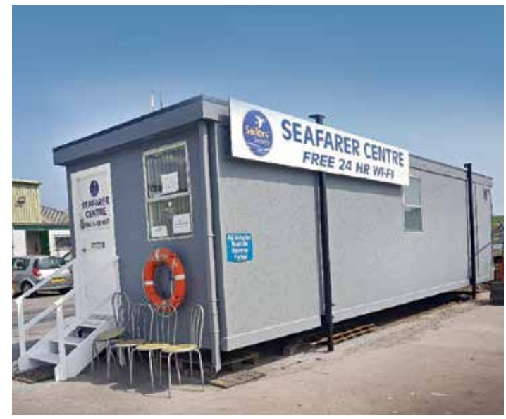
The refurbished Montrose Seafarers' Centre