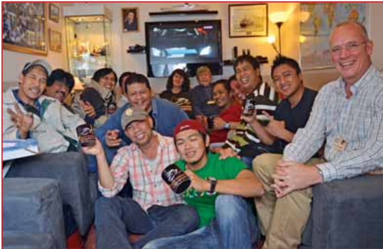
The centre is a place of friendship, support and advice - with ship visiting all year round.