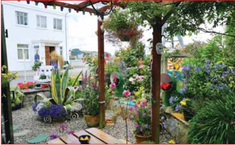
Garden and Summerhouse open 24hrs a day.